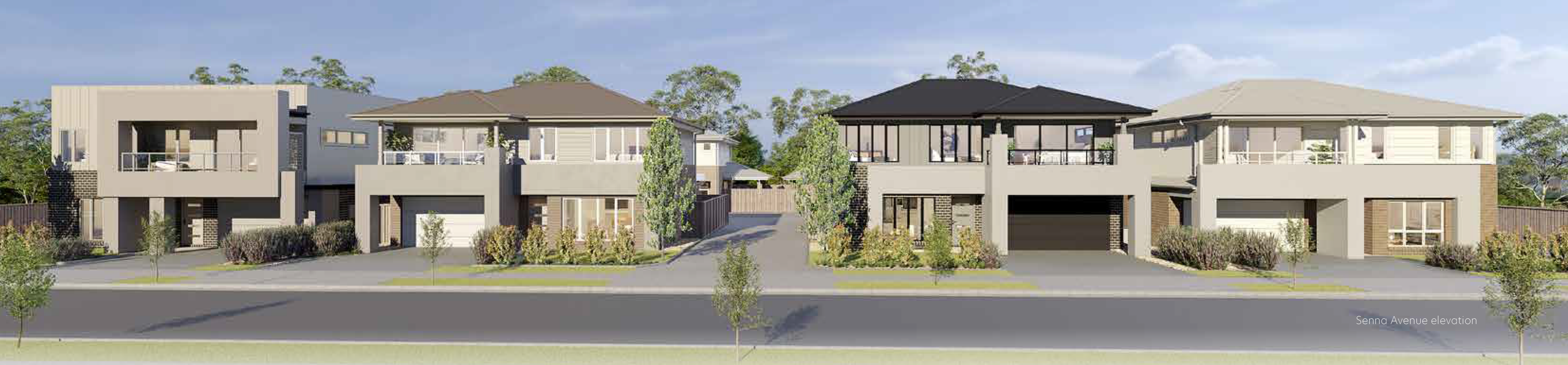
Senna Avenue elevation