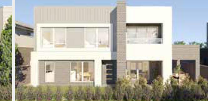
McMahon facades shown from Denham Court Road.